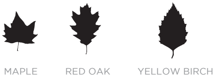
MAPLE RED OAK YELLOW BIRCH